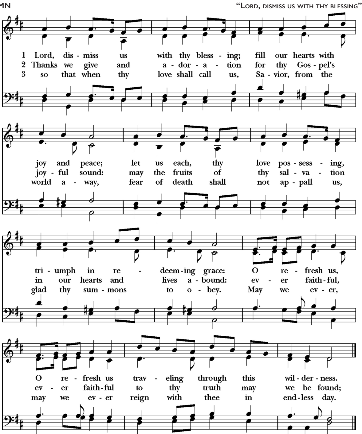
Words: Att. John Fawcett (1739/40-1817) Music: Sicilian Mariners, Sicilian melody; first published The European Magazine and London Review, 1792, alt.

Some of the music in this service used with permission to podcast/stream/ reproduce under OneLicense, License #A-700776. All rights reserved. Other music from Church Publishing (Hymnal 1982; Wonder Love & Praise; Lift Every Voice and Šing II) is reproduced under a license from RiteSong. All rights reserved.